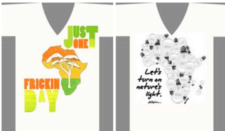
Rag & Bone, Phillip Lim